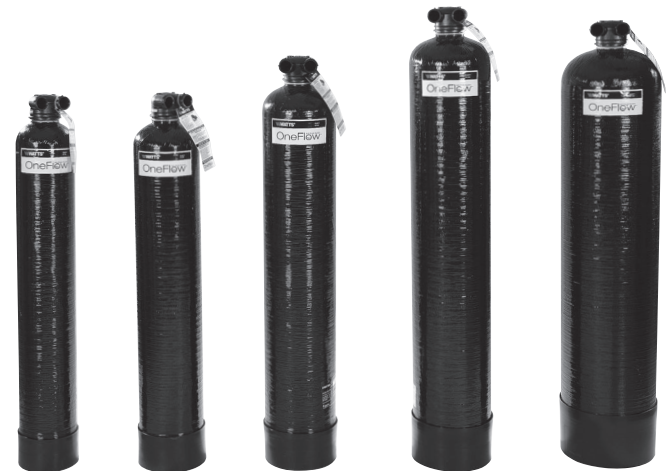
OF744-10 OF844-12 OF948-16 OF1054-20 OF1252-30

* For hot water applications where water temperature is 110°F – 150°F (43°C – 66°C), please consult ES-OneFlow-HotWater